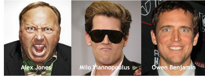
Influencers we used as case studies